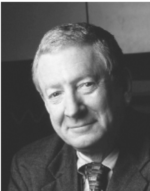
Alfred G. Gilman, M.D., Ph.D. Dean, UT Southwestern Medical School